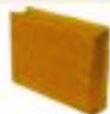
Gold Glittery Clutch

Go glam with this limited edition series! This gold glittery bag has a Japanese print lining along with red silk fabric to add fun and excitement. A gold brass snap and handle accents the exterior. Perfect for a special evening out. No two bags are exactly alike. LP126, W226, H66.