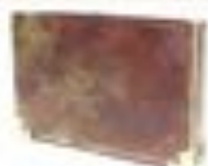
Not the Omnibus Handbag

Go glam with this limited edition series! This gold glittery bag has a Japanese print lining along with red silk fabric to add fun and excitement. A gold brass snap and handle accents the exterior. Perfect for a special evening out. No two bags are exactly alike. LP126, W226, H66.