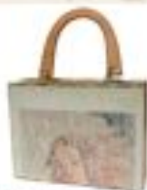
Birth of Venus Handbag

Peacock feathers on a vintage book help create this classic limited edition handbag. Green velvet adorns the Asian script interior. The exterior is fitted with silver handles, hardware and closures. No two bags are exactly alike. Materials may vary based on availability. LP126, W2126, H66.