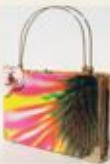
Mauve Glittery Handbag

Rich and tropical...this handbag takes you back to that summer island getaway.